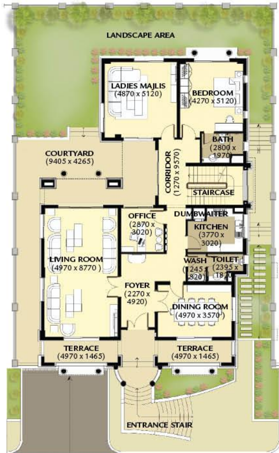
1st Level (248 sqm) / Yard (239 sqm) Covered / unclosed (45 sqm)