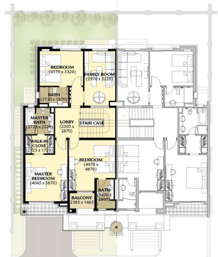
2nd Level (141 sqm) / Terrace (7 sqm)