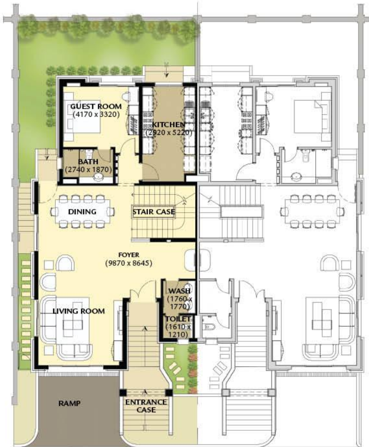
1st Level (144 sqm) / Yard (76 sqm)